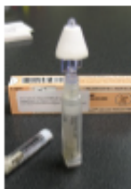
Naloxone solution combined with a nasal adaptor allows for the drug to be given as a nasal spray.

Naloxone is a liquid prescription medication that works to reverse an overdose that is caused by an opiate drug. It works by